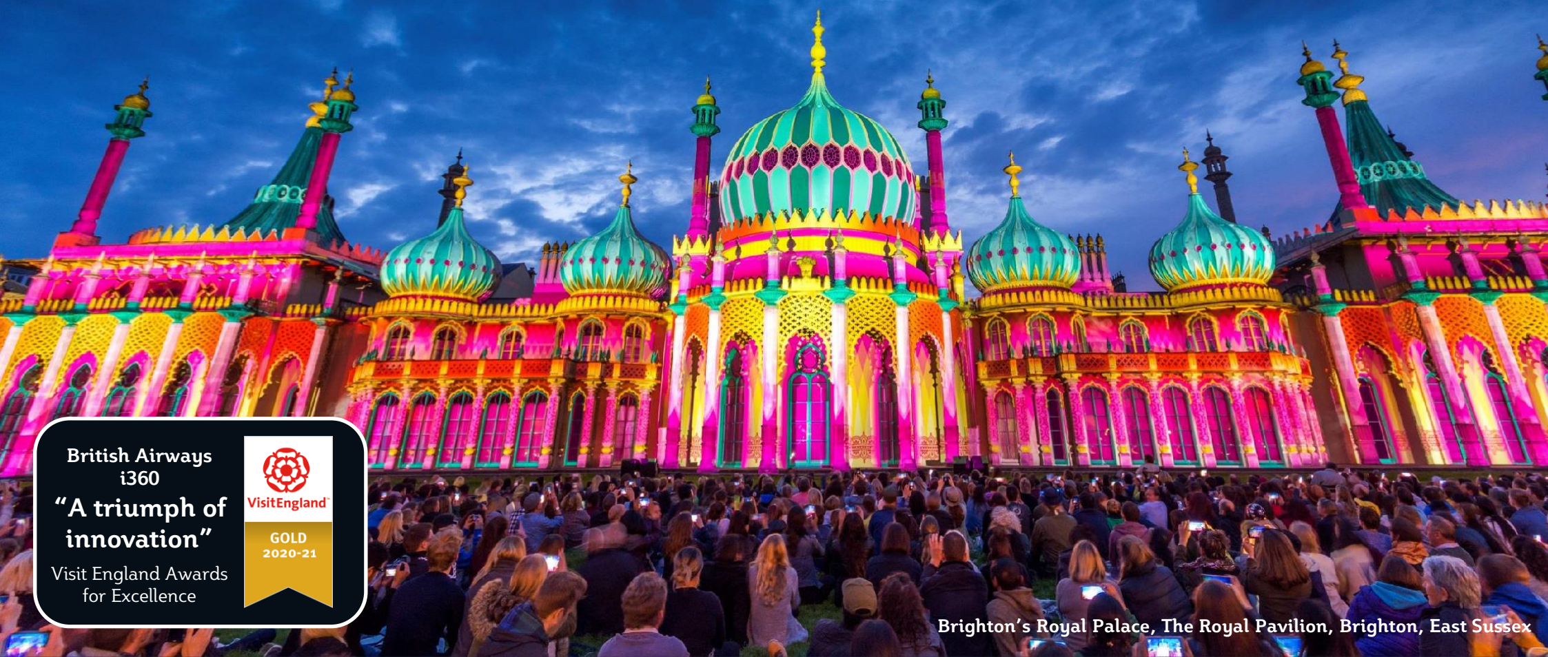
Brighton's Royal Palace, The Royal Pavilion, Brighton, East Sussex